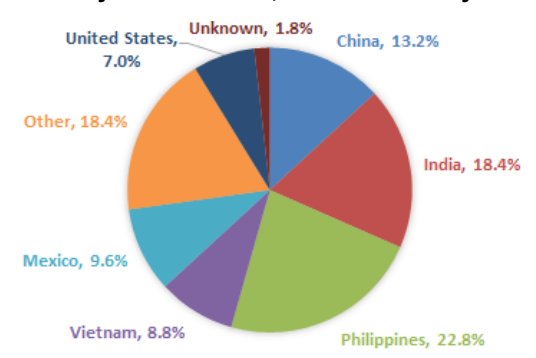
Figure 2: Incident TB Cases (2019) by Place of Birth, Alameda County

During 2019, 114 tuberculosis (TB) cases were reported to Alameda County (excluding the City of Berkeley). The 2019 TB case rate in Alameda County was 7.4 cases per 100,000 residents, a 26% decrease from the 2018 rate. The 2019 rate ranks seventh among all jurisdictions in California and is 0.5-fold higher than the California state rate of 5.3 cases per 100,000 residents. Compared to other Bay Area jurisdictions, the Alameda County rate ranks lower than San Francisco (13.4 per 100,000), Santa Mateo (8.5 per 100,000), and San Clara (8.4 per 100,000), but higher than Solano (7.0 per 100,000), and Contra Costa (5.0 per 100,000) counties.