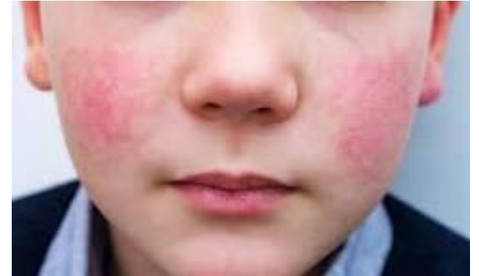
“Slapped Cheek” rash