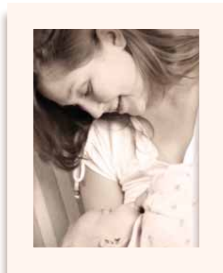
Nurse often when you and your baby are together.