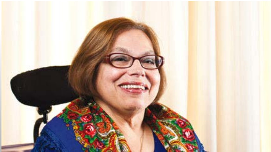
Judy Huemann, Disability Rights Advocate and former Assistant Secretary, U.S. Department of Education, Office of Special Education Programs

“For most of us technology makes things easier, for people with disabilities it makes things possible”