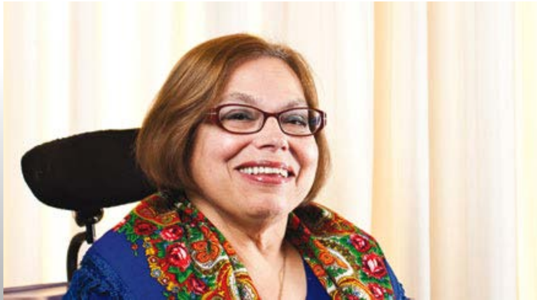
Judy Huemann, Disability Rights Advocate and former Assistant Secretary, U.S. Department of Education, Office of Special Education Programs

“For most of us technology makes things easier, for people with disabilities it makes things possible”