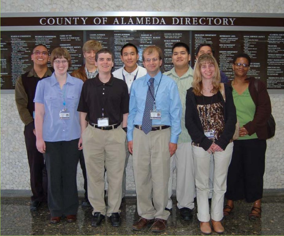
County of Alameda Class of 2011