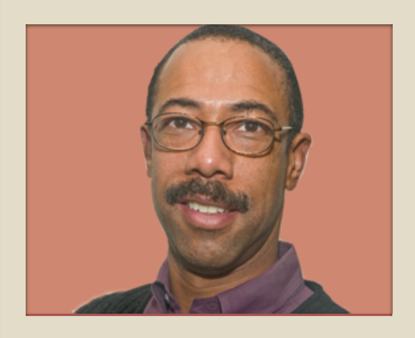
The National HIV/AIDS Strategy: A Synopsis – Part II