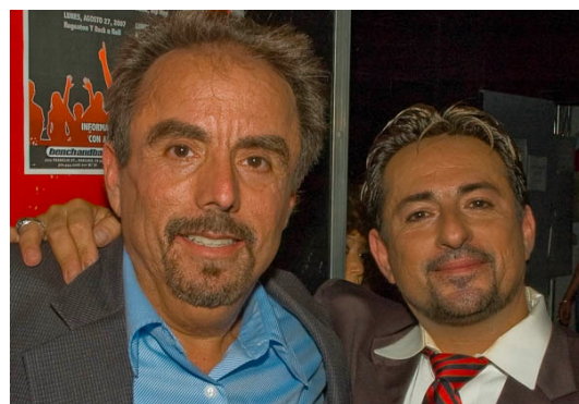
Grupo Fremont VIP Takes a Year Off