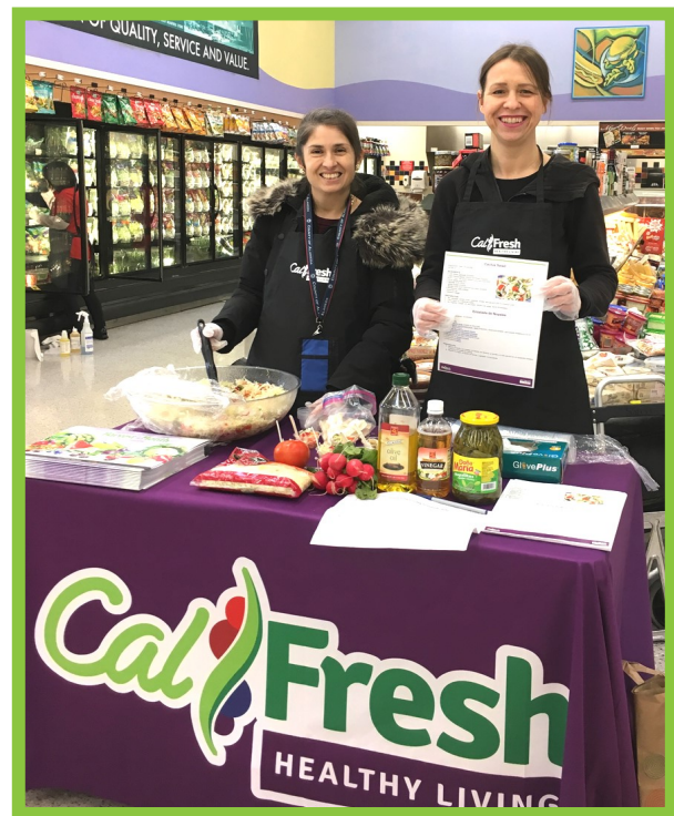
Nutrition Services Healthy Retail Team hosting a food demo and taste test with vetted healthy recipes