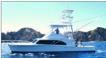
Figure 2: Photo of the type of vessel abandoned at Spud Point Marina and suspected in the attack

Yesterday around 5:00 PM, the San Francisco Bay Area BAC received information from the BioWatch laboratory in Southern California that 16 of the 32 daily filters from the collector units were tested positive for Bacillus anthracis DNA, indicating a possible exposure to anthrax spores across a wide portion of the San Diego.