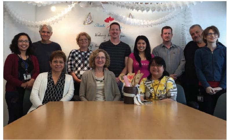
Alameda County Laboratory group