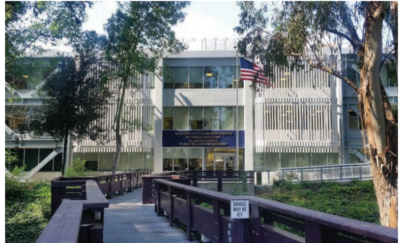
Alameda County Public Health Laboratory

The Alameda County Public Health Laboratory occupies one of the most distinctive laboratory facilities in the country—a three-story concrete, steel and glass edifice outfitted with an exoskeleton of latticework festooned with “gigantic shock absorbers,” which encircle the building. The unusual structure is the most visible sign of the subterranean Hayward Fault line that lies a mere 500 yards from the laboratory.